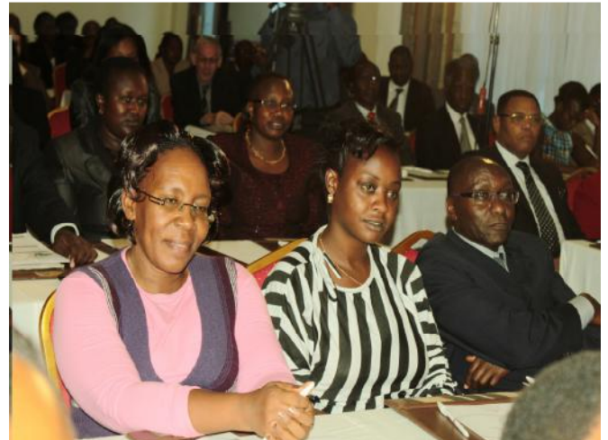
Members of the Institute during the Governance Forum