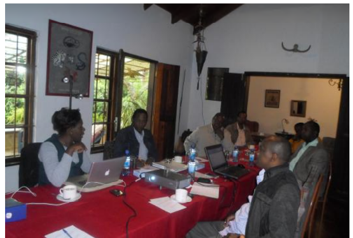
Members of the Taskforce on the development of the Code of Governance for the Kenya Private Sector at Macushla House, Karen

The Members of the Taskforce on the development of the code met at Macushla House, Karen on March 15, 2014 to commence the development of the code.