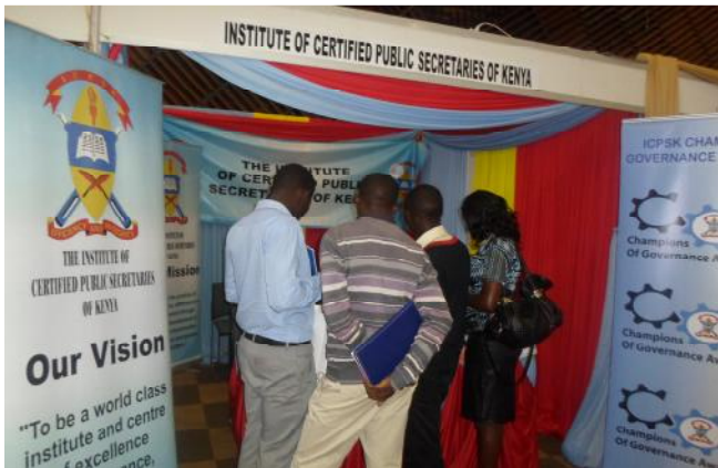
Students from various Universities visit the ICPSK stand during the Capital Markets open day at the KICC