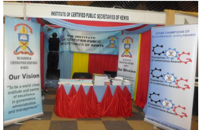
The Secretariat sets up for the CMA open day at the KICC

The objective of the open day is to facilitate an enabling environment where current and potential investors and issuers interact with the various capital market intermediaries and receive pertinent information that will assist them to make informed decisions while participating in the capital market industry.