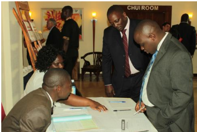
The Secretariat assists members to register during the Governance Forum