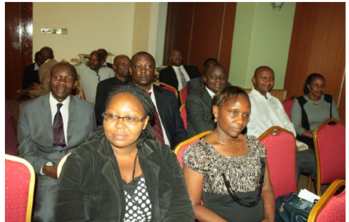
Members of the Institute during the Governance Forum