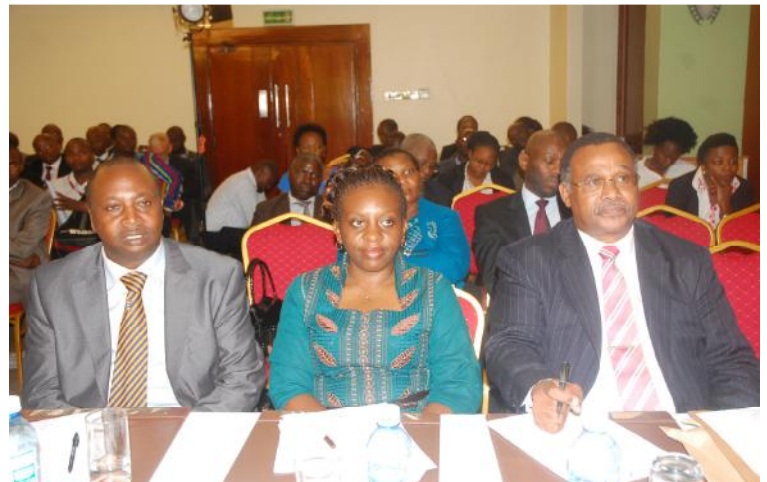
Proceedings during the ICPSK Governance Forum held on March 4, 2015 at the Sarova Panafric Hotel, Nairobi