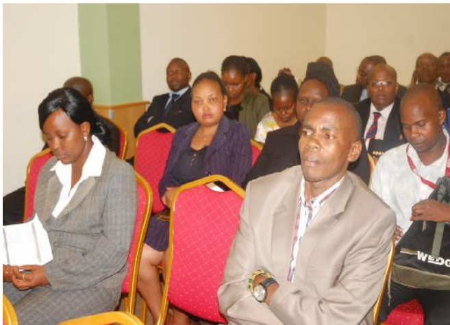
Members of the Institute during the ICPSK Governance Forum held on March 4, 2015 at the Sarova Panafric Hotel, Nairobi